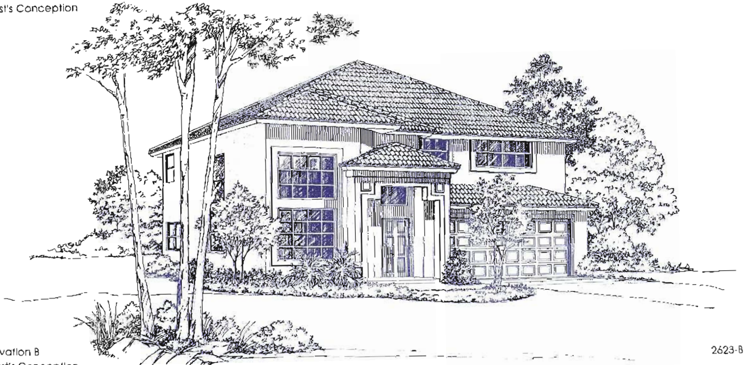
Elevation B Artist's Conception