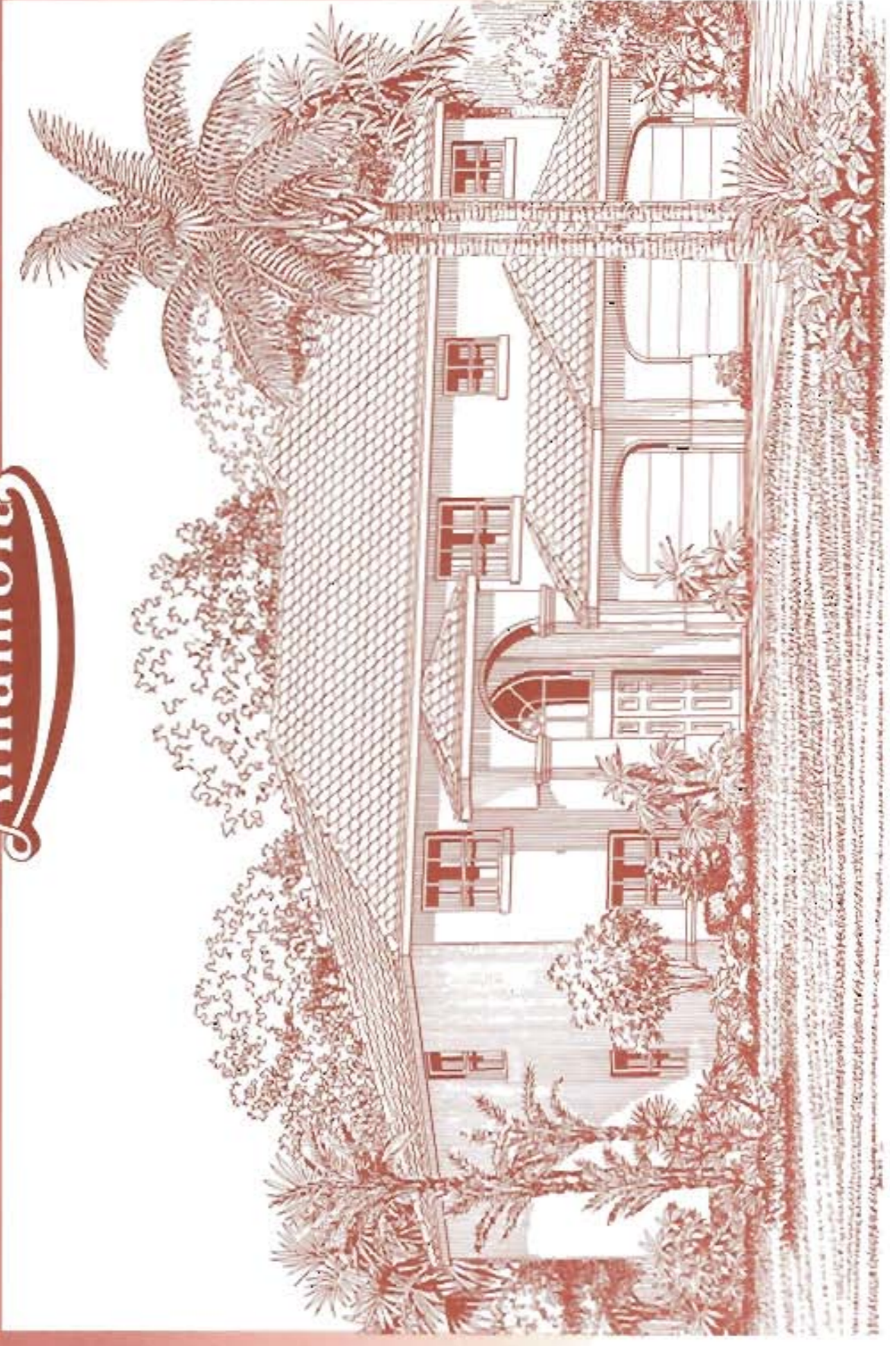
Edinburgh IV 4 Bedrooms • 3 Baths • Family Room • 3-Car Garage Elevation 2