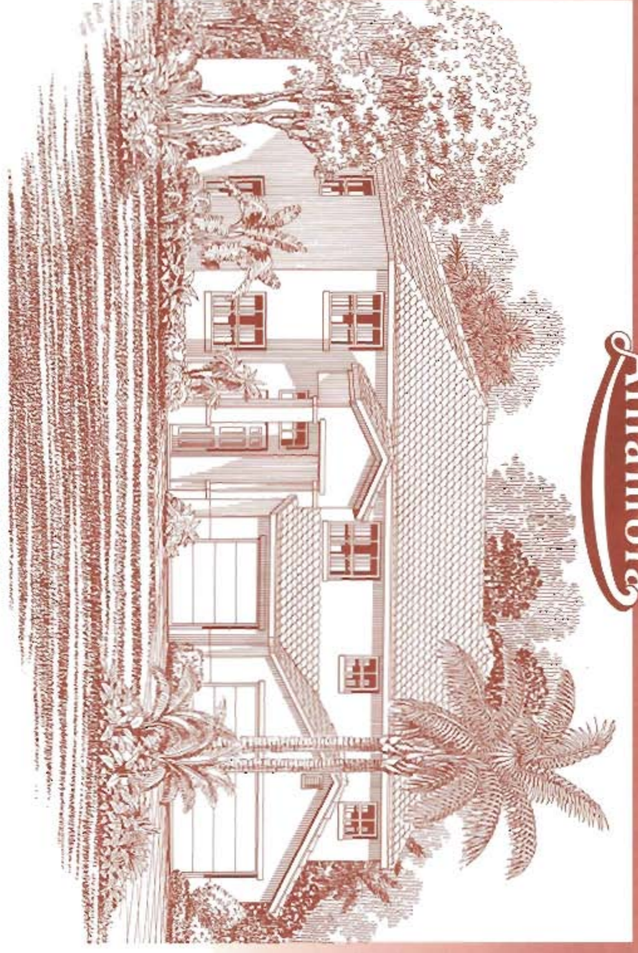
Edinburgh IV 4 Bedrooms • 3 Baths • Family Room • 3-Car Garage Elevation 1