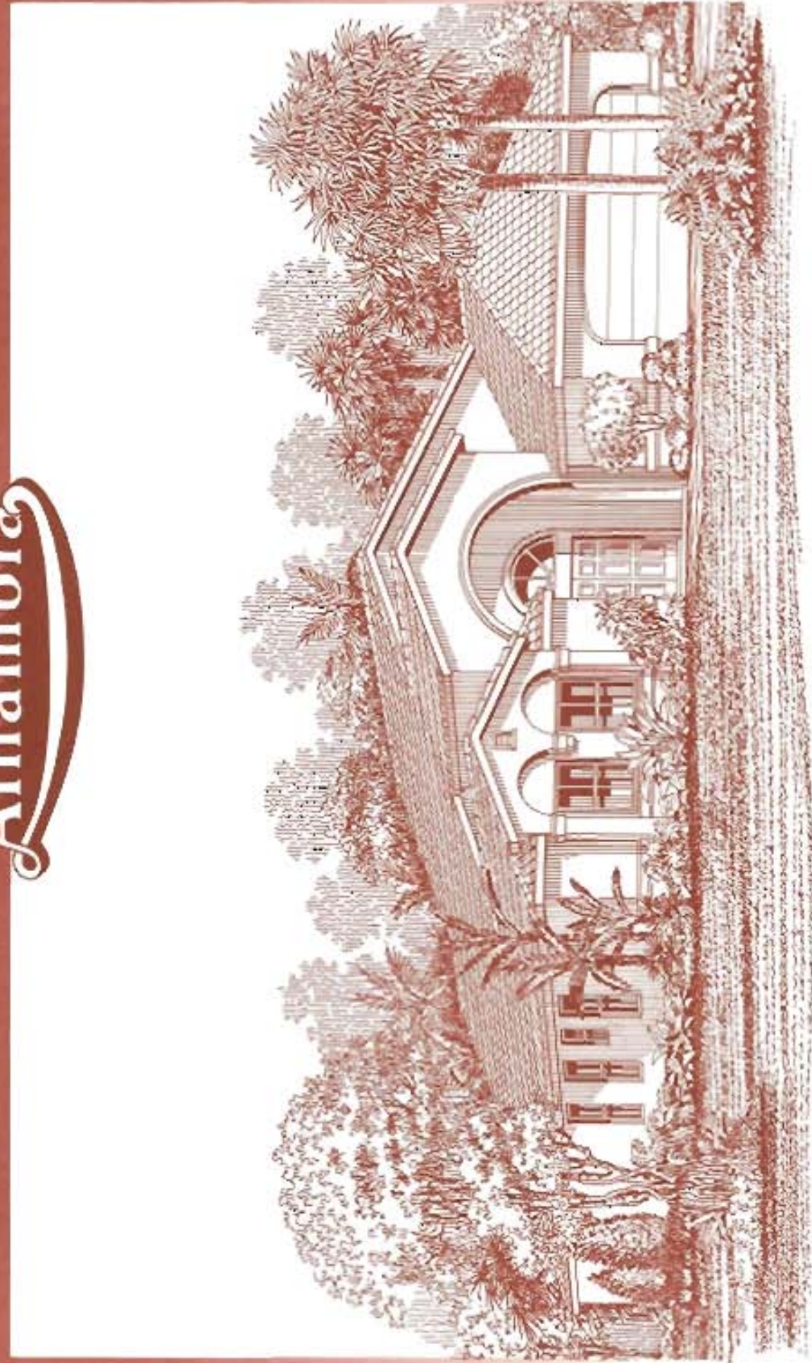
Dover 4 Bedrooms • 2 Baths • Family Room • 2-Car Garage Elevation 2