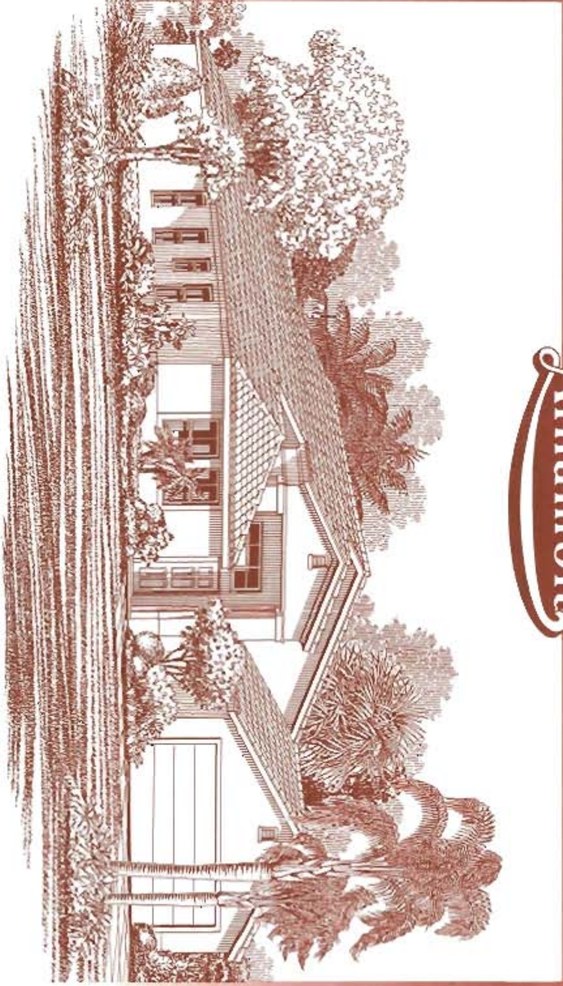
Dover 4 Bedrooms • 2 Baths • Family Room • 2-Car Garage Elevation 1