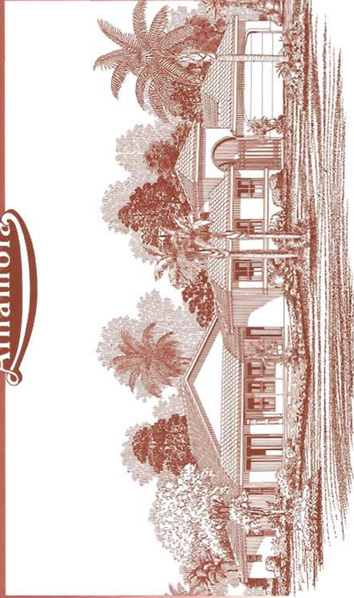
Chambord 4 Bedrooms • 3 Baths • Family Room • 2-Car Garage Elevation 2