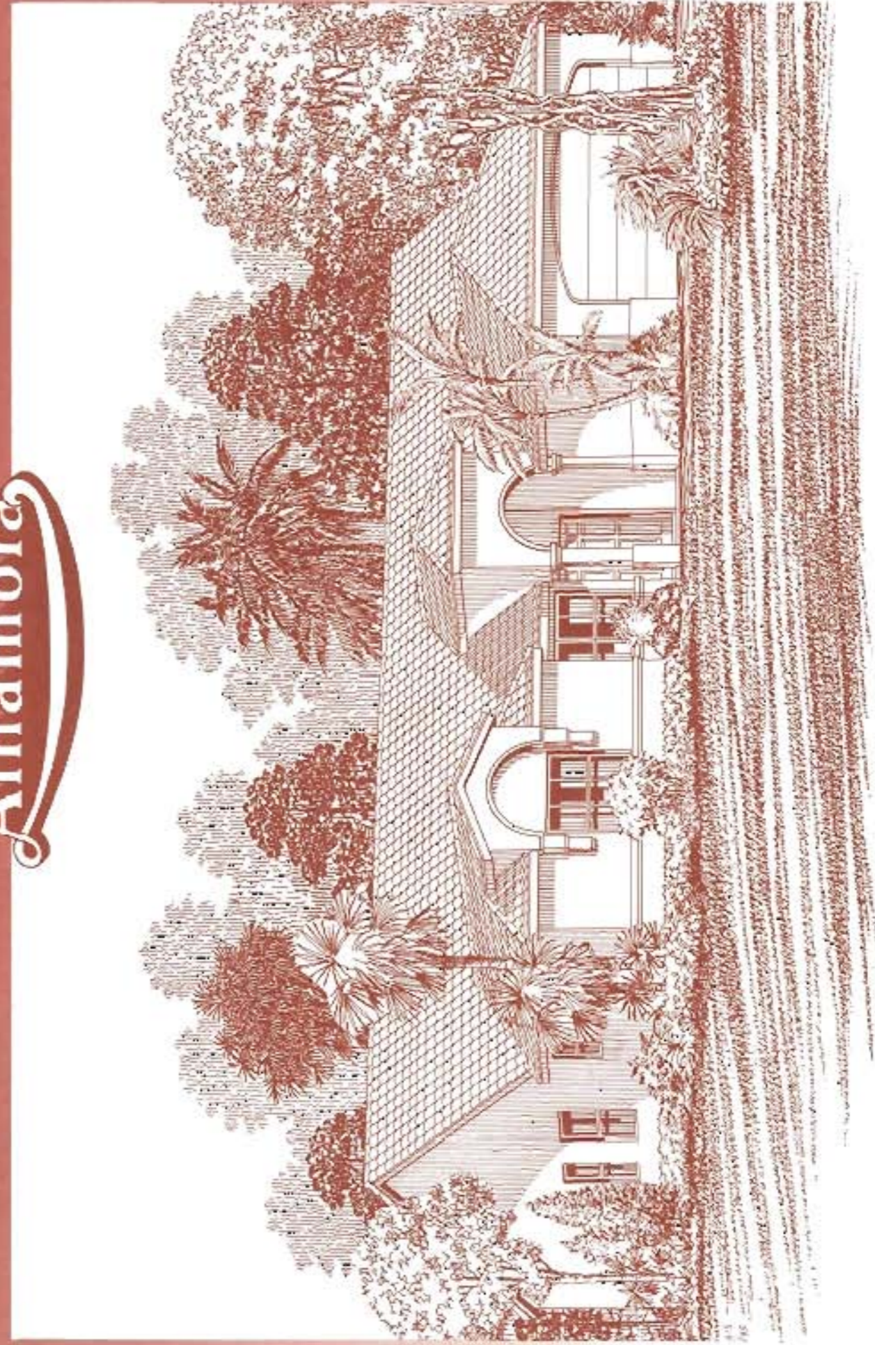
Alvorado III 3 Bedrooms • 2 Baths • Family Room • 2-Car Garage Elevation 2